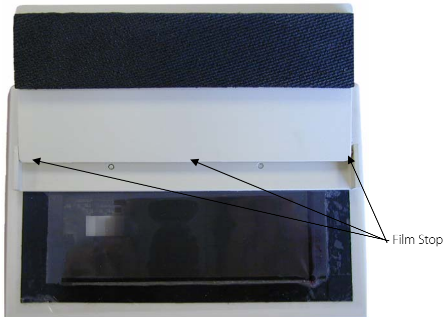
Figure 2-1. Film Insertion